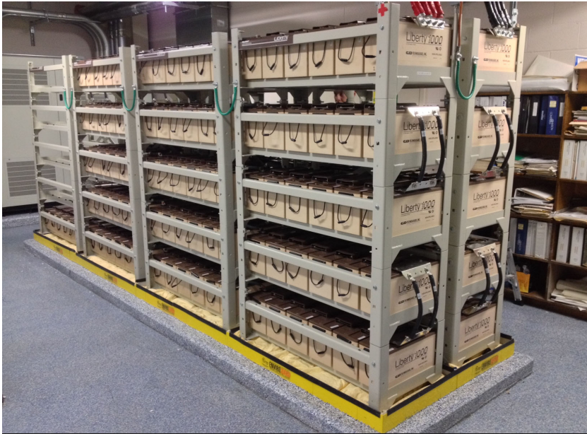
Stationary Battery & Power Electronics

The Krydon Group Inc. is C&D Technologies' exclusive government representative and manages all federal, state and local government orders. C&D products are providing backup power and smart energy solutions for the Government's critical information infrastructure at sea, at forward deployed bases, and here in the United States. Our products are made in the US and supported with US based personnel.