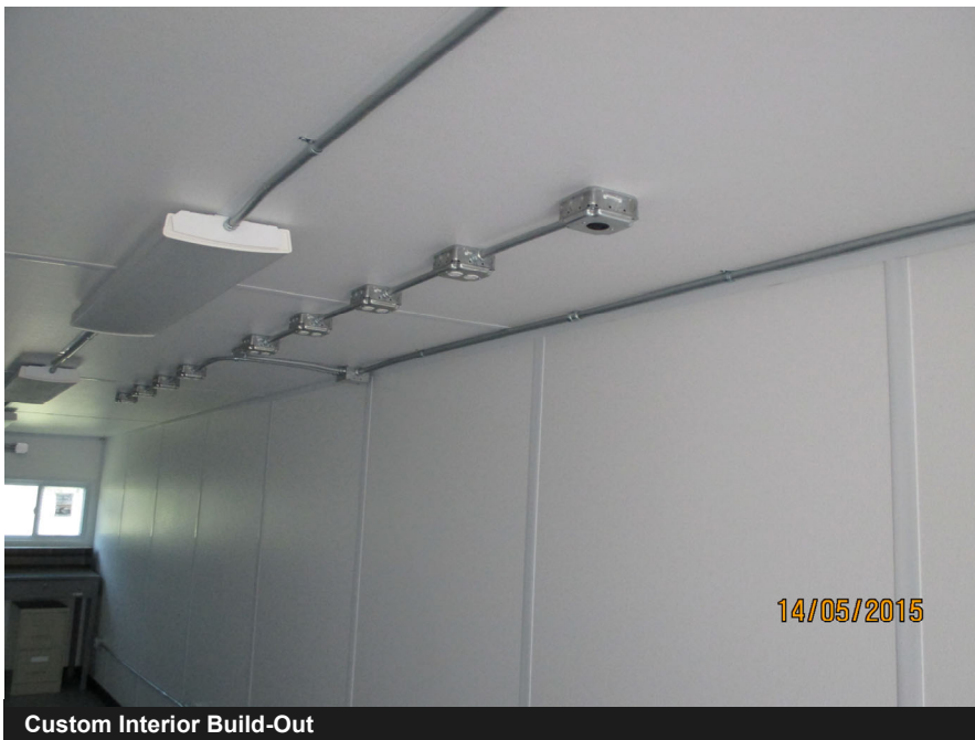
Custom Interior Build-Out

Krydon's manufacturing capabilities are adaptable to your specific needs. Our team is ready to help you at every step of the process. We also understand that change orders during the approval process, and subsequent construction may result in modifications to the original design which are a part of many projects. If this occurs, we can incorporate these changes, limiting any impact on your requested delivery date, and keeping your project on schedule. Whether your shelter building needs include customer installed equipment, or simple electrical requirements, we have the solution. Integrated and installed systems such as AC/DC, controls, power generation components and power storage or other applications, can be pre-tested for quality and reliability so you will be up and running as soon as your building is delivered.