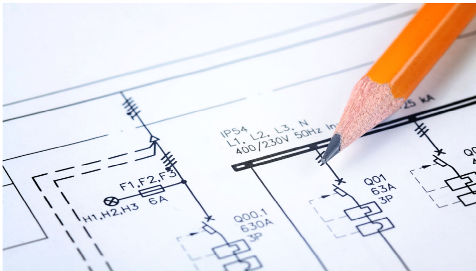
System Design Support

We find that building trust is an effective way to do business. When a business relationship is based on trust, projects run smoother and ultimately with a better final outcome. Earning our clients' trust involves teamwork, communication and a shared vision. Because we are a team, we only succeed when our clients succeed.