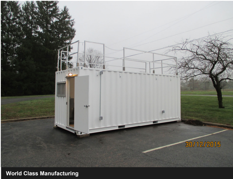
World Class Manufacturing

Our firm has been engaged by several agencies and private firms to custom manufacture wireless shelters, portable mobile laboratories, air monitoring trailers and portable power containers. The basis of our construction is the standard ISO shipping container. This structure provides incredible durability, structural strength and versatility in modification for the end user. Our skilled craftsman can transform an ISO container to meet your organization's mission objectives.